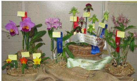
Above: a modest but beautiful display at a show

The East Texas Orchid Society has begun planning the first-ever orchid show to be held in Nacogdoches! Although the actual date isn't pinned down, we are shooting for fall of next year. It seems like a long time to prepare but it will be a valuable learning experience for our small group.