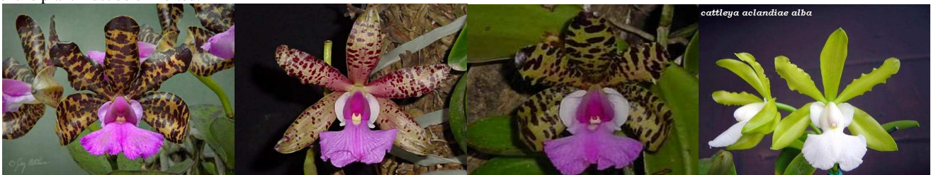
This photomontage shows the extreme variation in just one species, Cattleya aelandiae . Note the variation in lip color, degree and pattern of spotting, shape and fullness of the petals, and overall presentation. The far left picture shows the cultivar 'Krull-Smith', awarded an FCC (93 points) just last month.

To contact ETOS or view previous newsletters, visit our website at: www.easttexasorchidsociety.com .